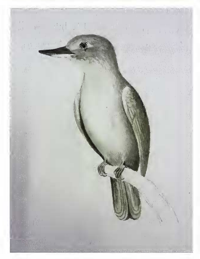
Figure 1 (above left). Pl. 135 by John Webber, painted during Cook's third voyage; we consider this bird to be a Society Kingfisher Todiramphus veneratus youngi from Moorea

Figure 2 (above right). Pl. 22 by William Wade Ellis, painted during Cook's third voyage; we consider this bird to be a Chattering Kingfisher Todiramphus t. tutus